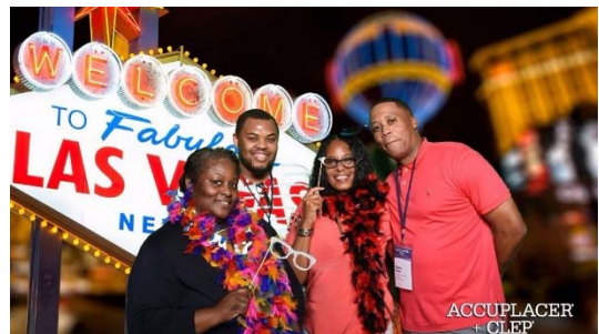
TACTP Members enjoying the educational benefits of the 2016 ACCUPLACER + CLEP National Conference in Las Vegas.